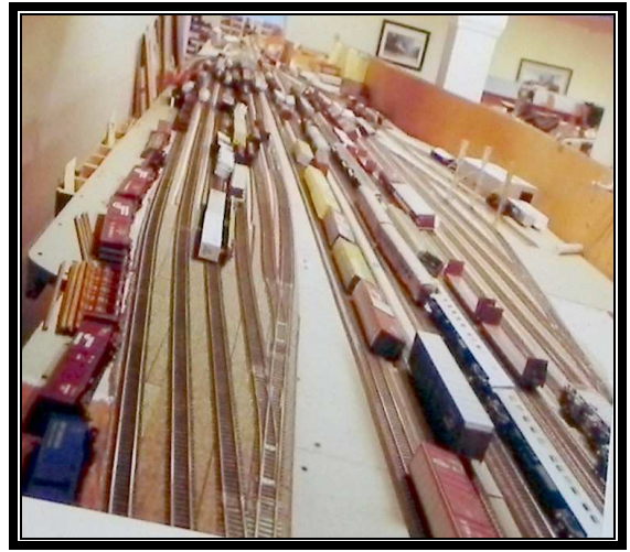
The Rathole Hit by the 5.8 Earthquake