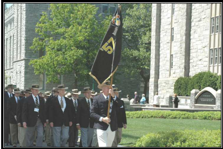
Reunion Celebrants Passing Our Class Gift of the Honor Court