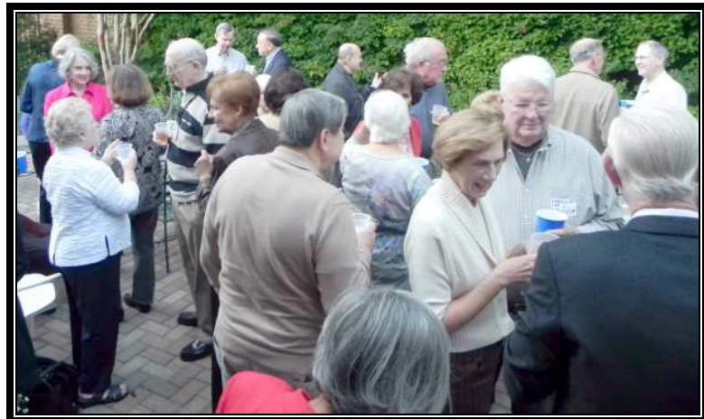
At My Command, Mill Around.....Mill!!