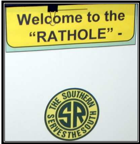
Where's the Cheese?