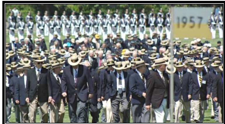
The Charge 50 Years Later - Now an Amble!