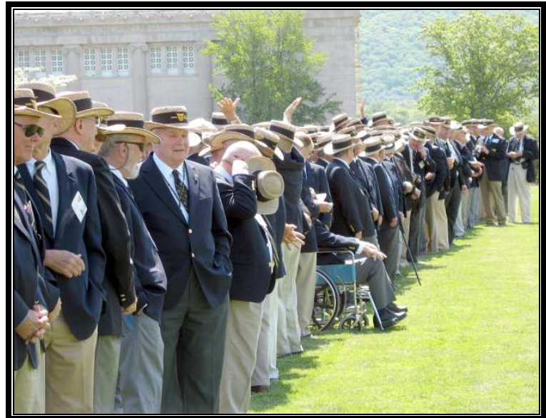
Did Anyone Say “Dress Right?”