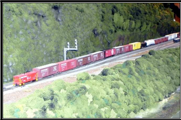
Boys and Their Toys!